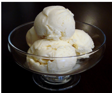
Ice Cream Slam Pie